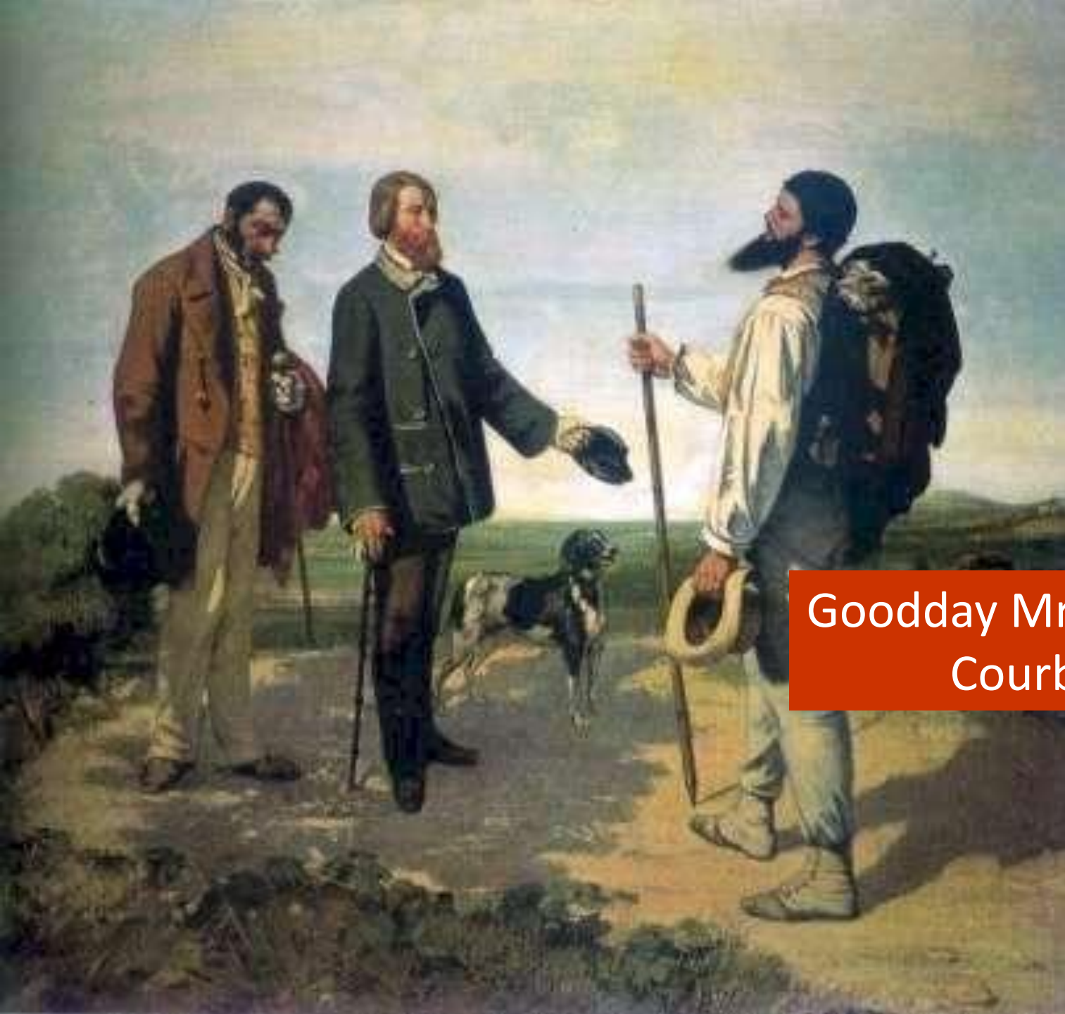
Goodday Mr. Courbet Courbet