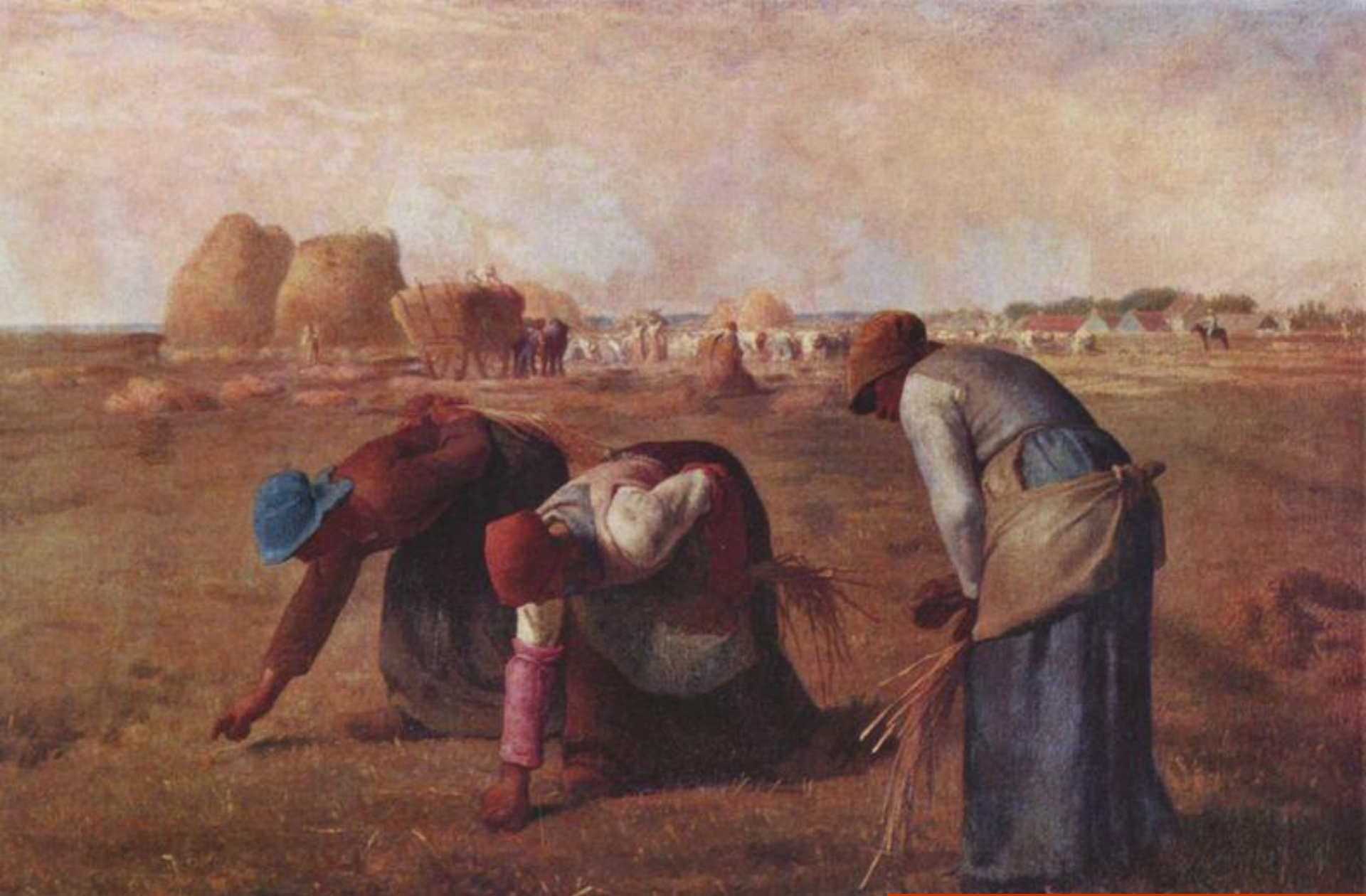
The Gleaners Jean-Francois Millet