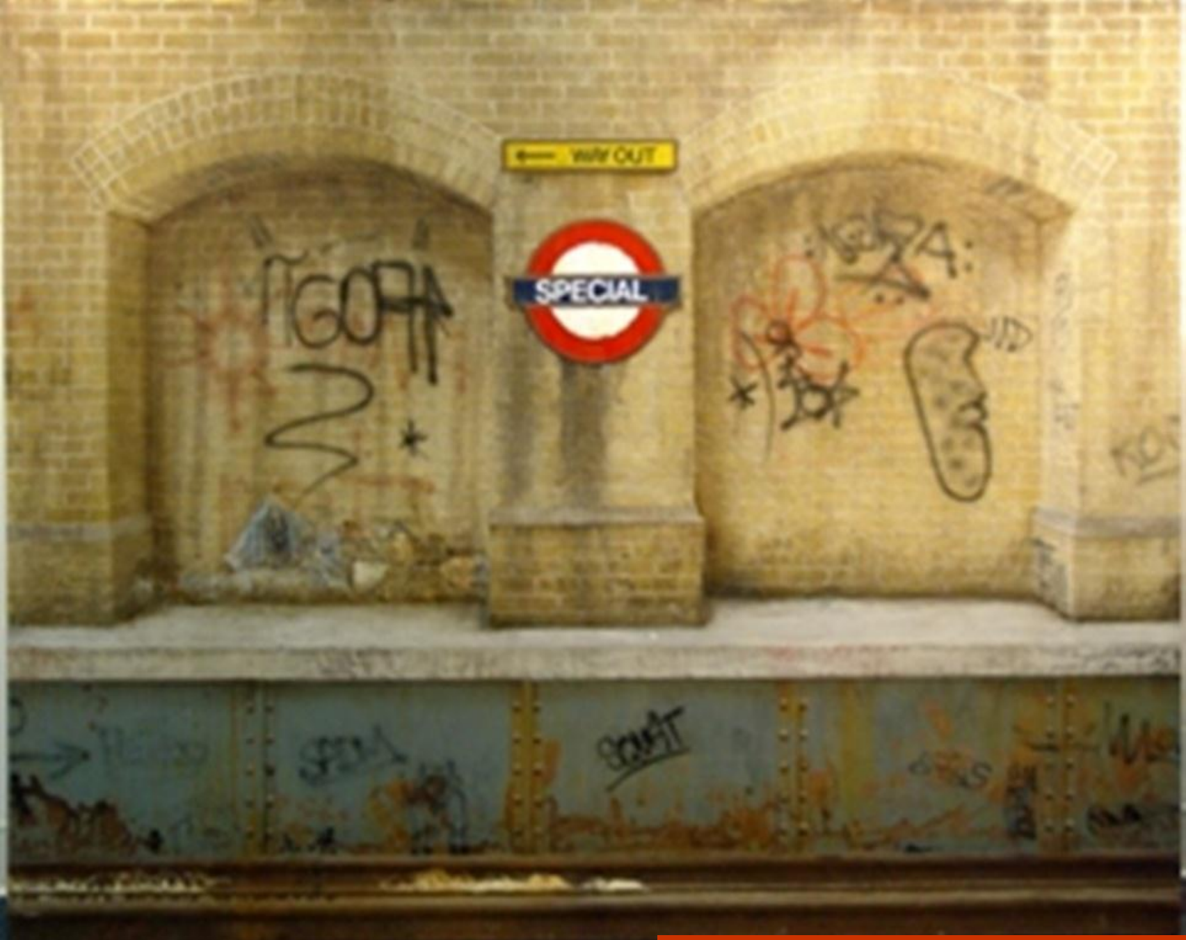
Rafael Cauduro – Subway station