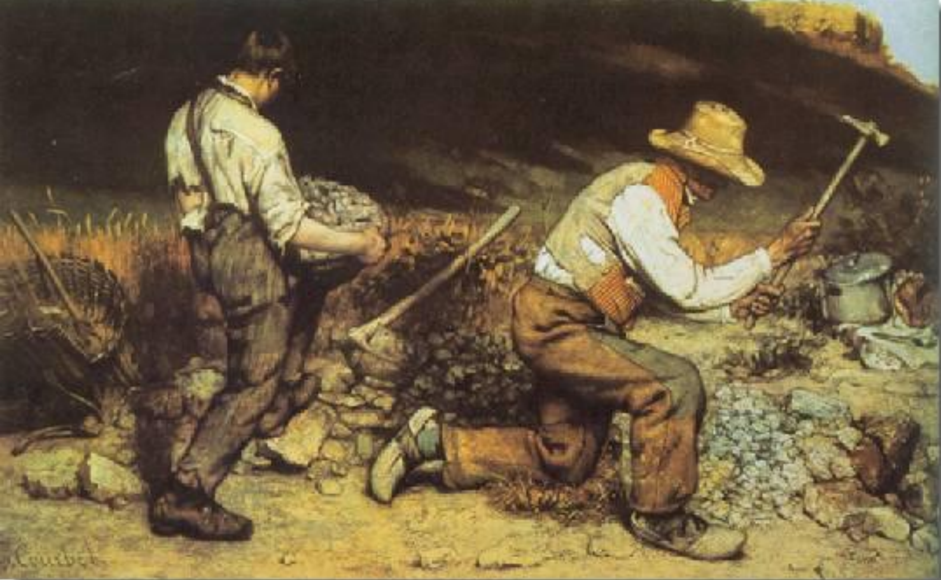
Stone breakers Courbet