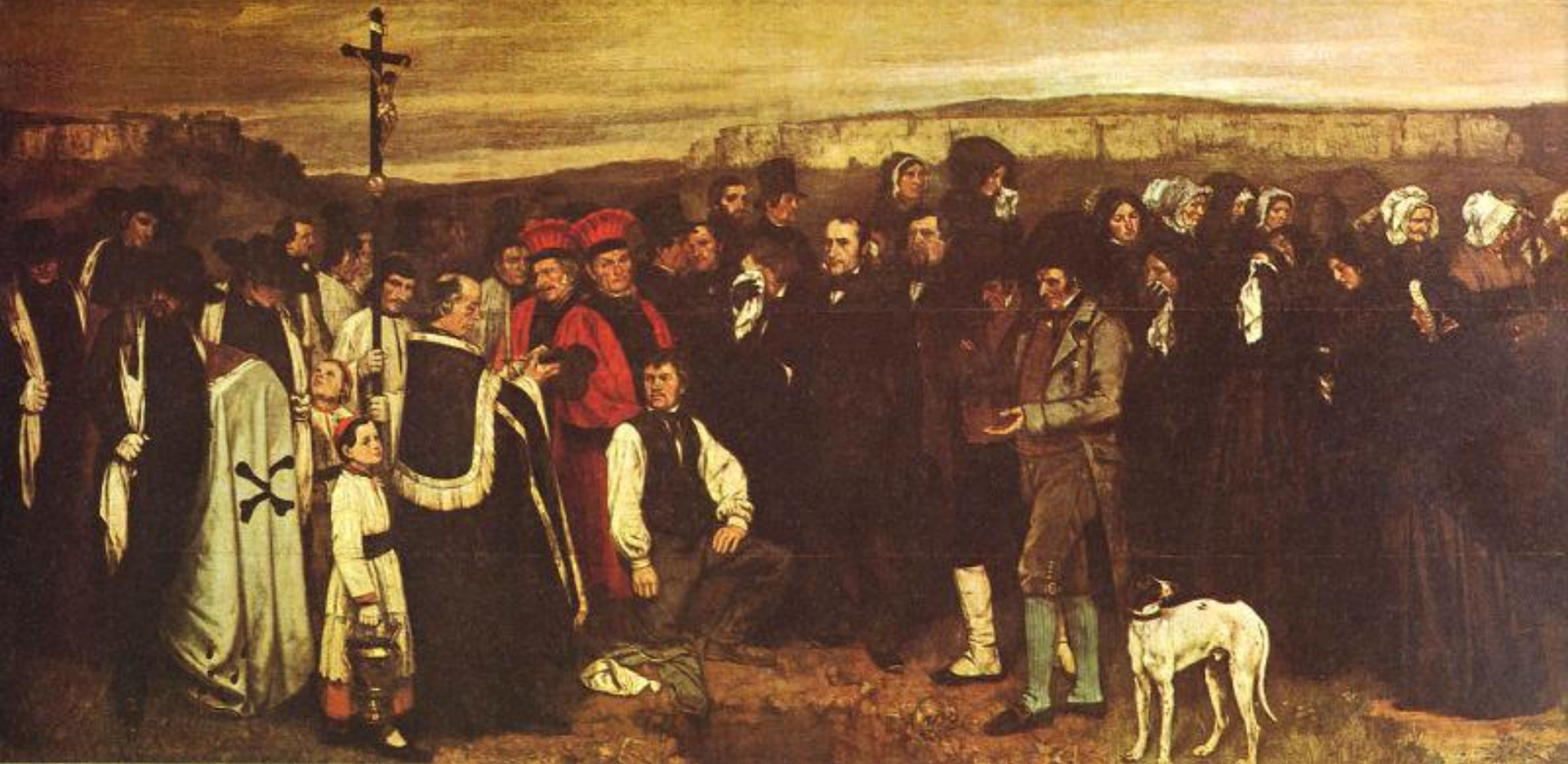
Burial at Omans Gustave Courbet