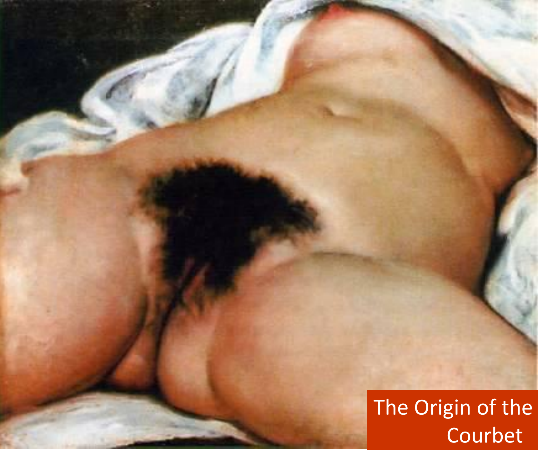
The Origin of the World Courbet