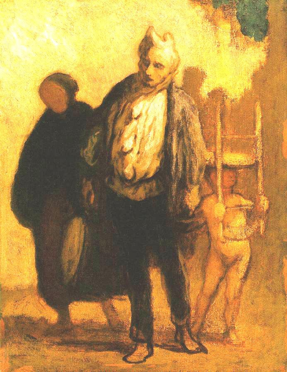
Saltimbanqui Honoré Daumier