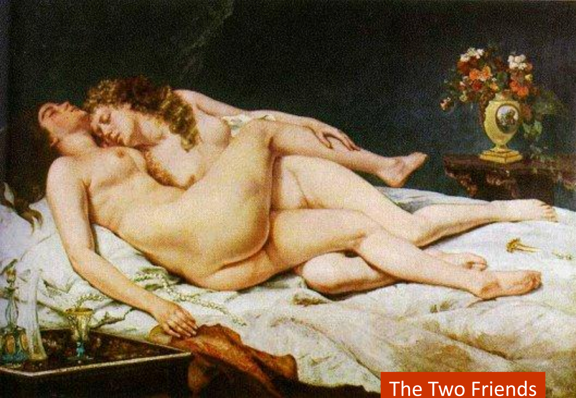
The Two Friends Gustave Courbet