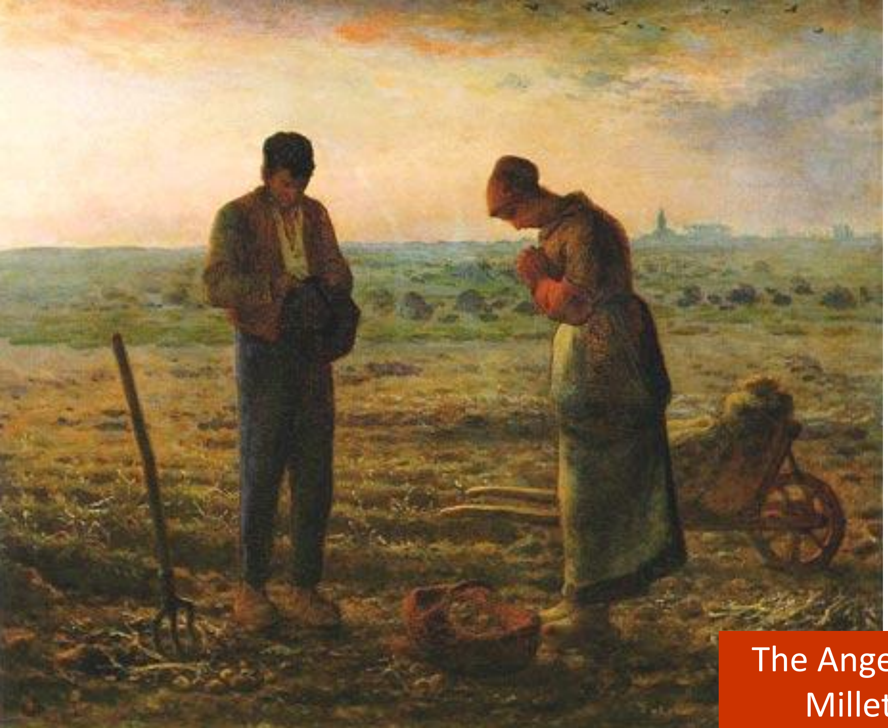
The Angelus Millet