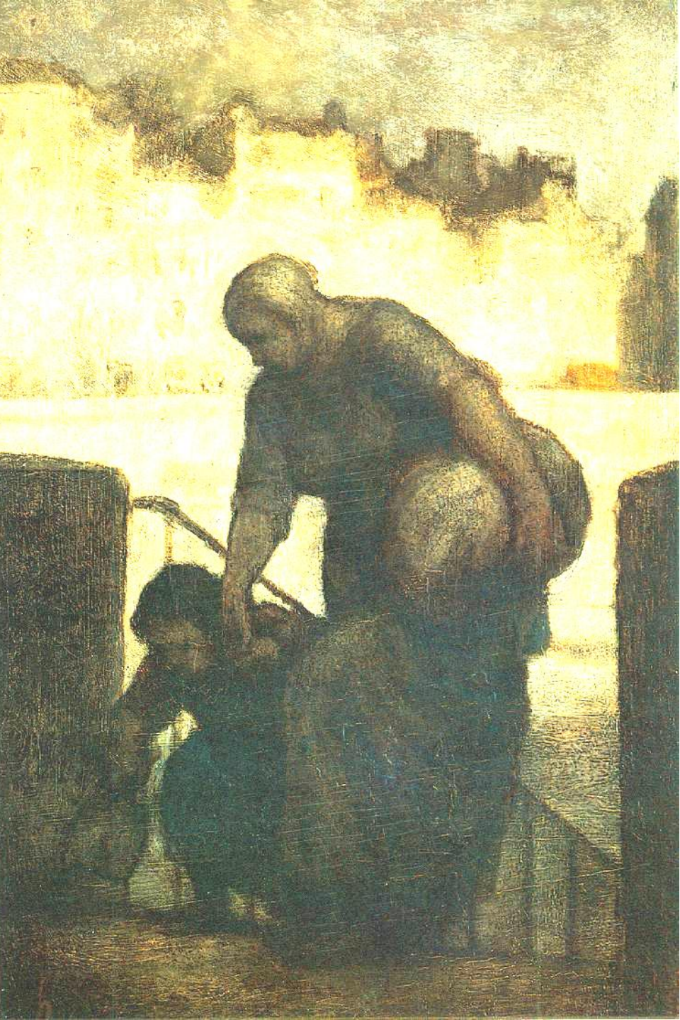
The Launderer Daumier