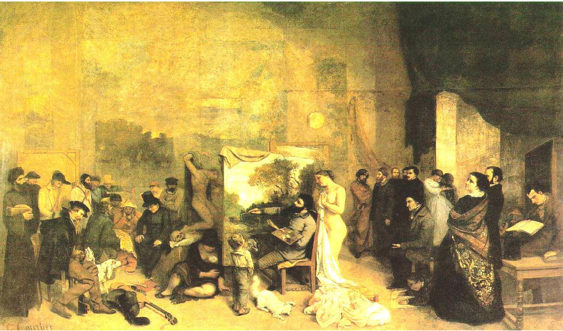
The Artist's Studio Courbet