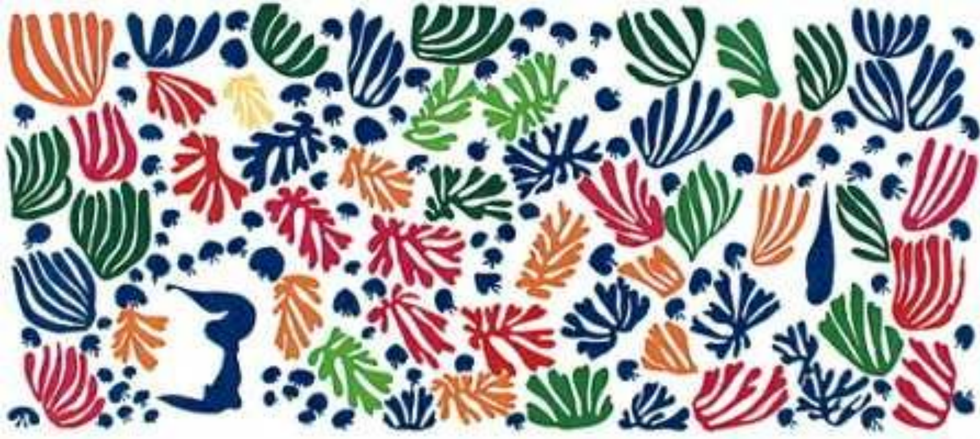
Sittich and the Mermaid Matisse