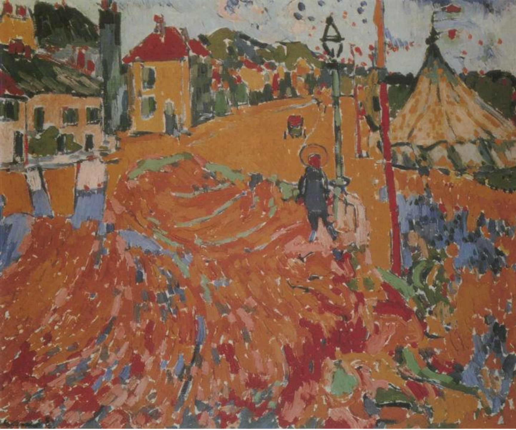
The Circus Vlaminck