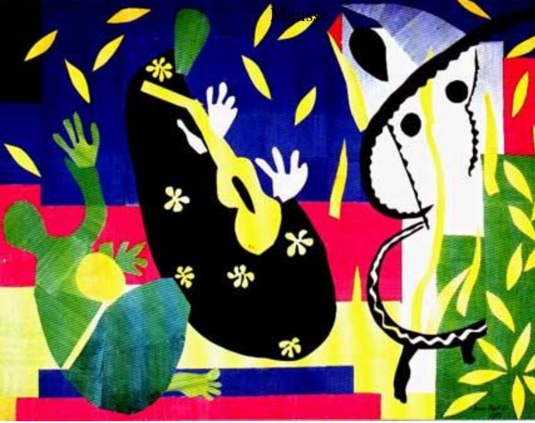
La Tristesse du roi (Sorrrows of the King) - Matisse