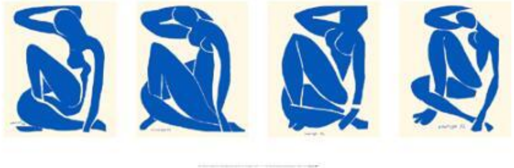
Naked woman in blue I, II, III, IV Matisse