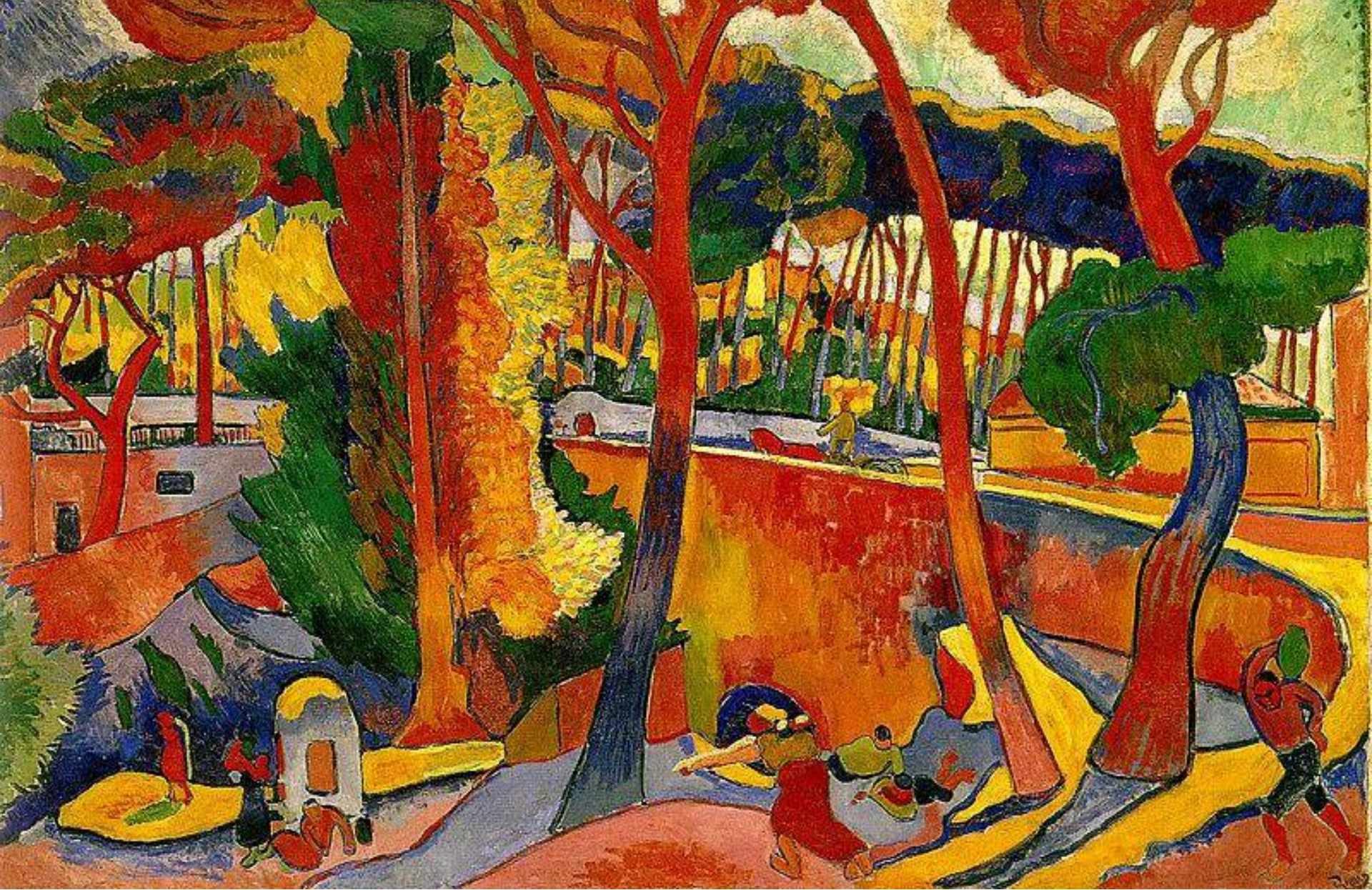
The turning road André Derain