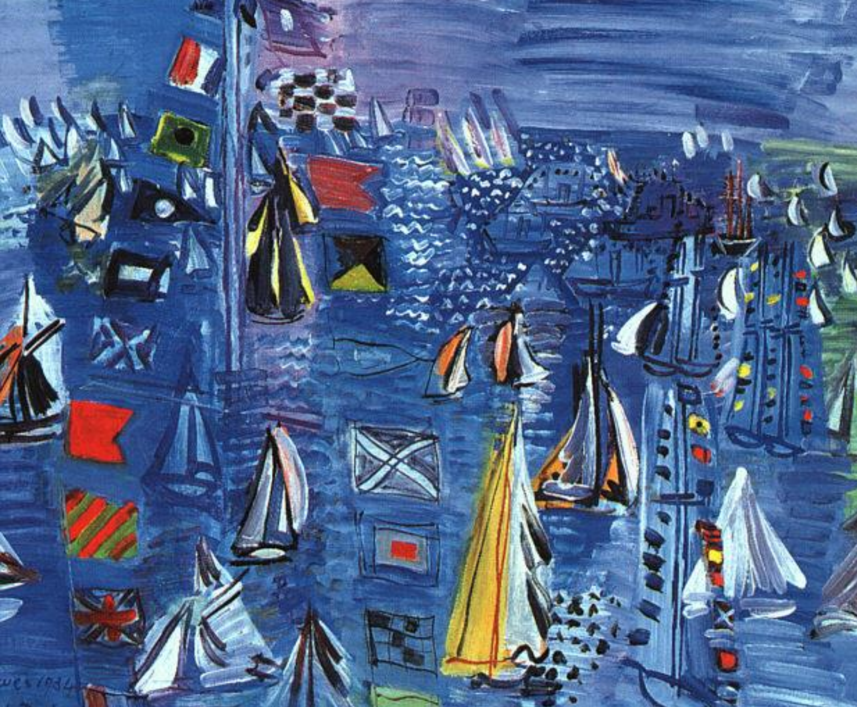
Regatta at Cowes