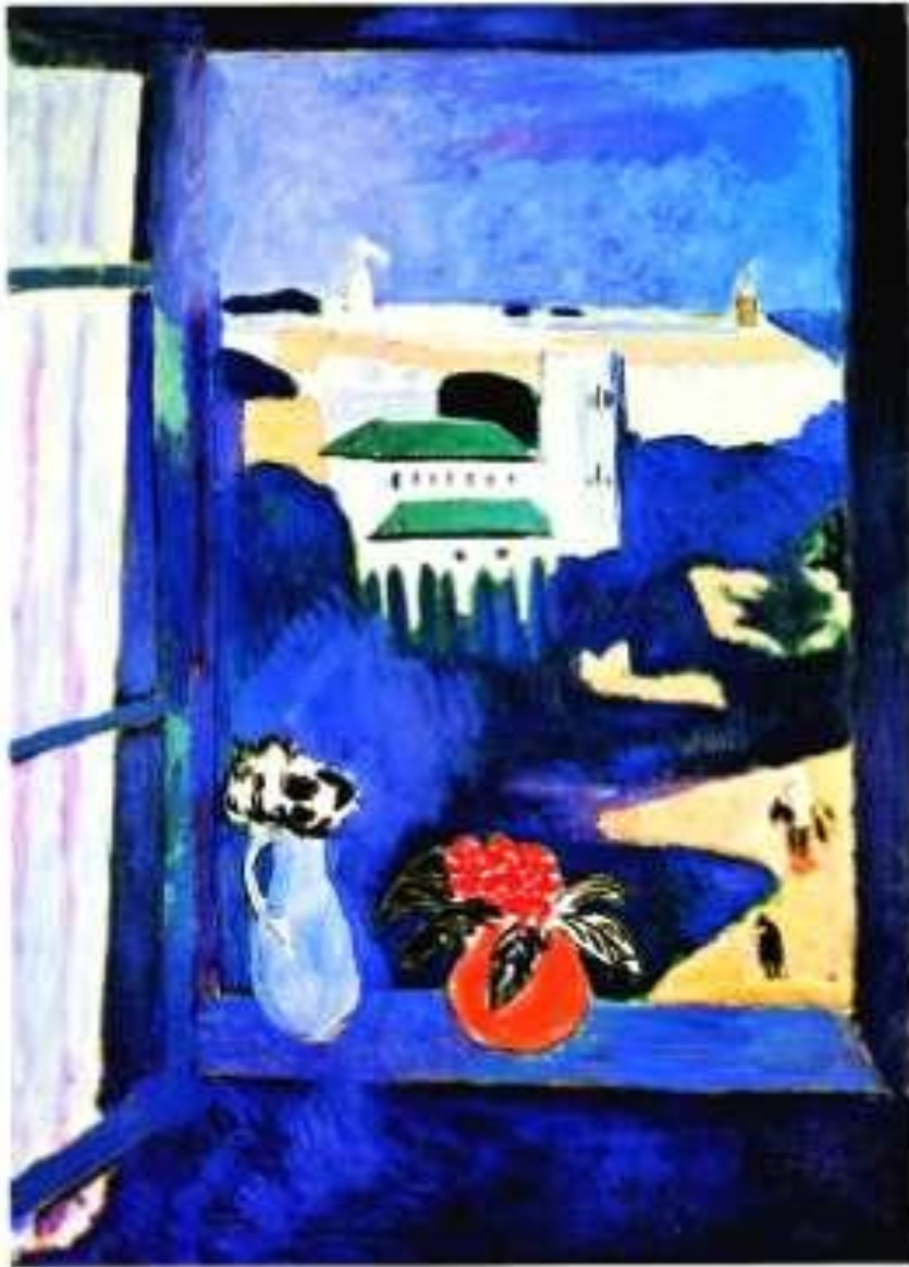
Through the window Matisse