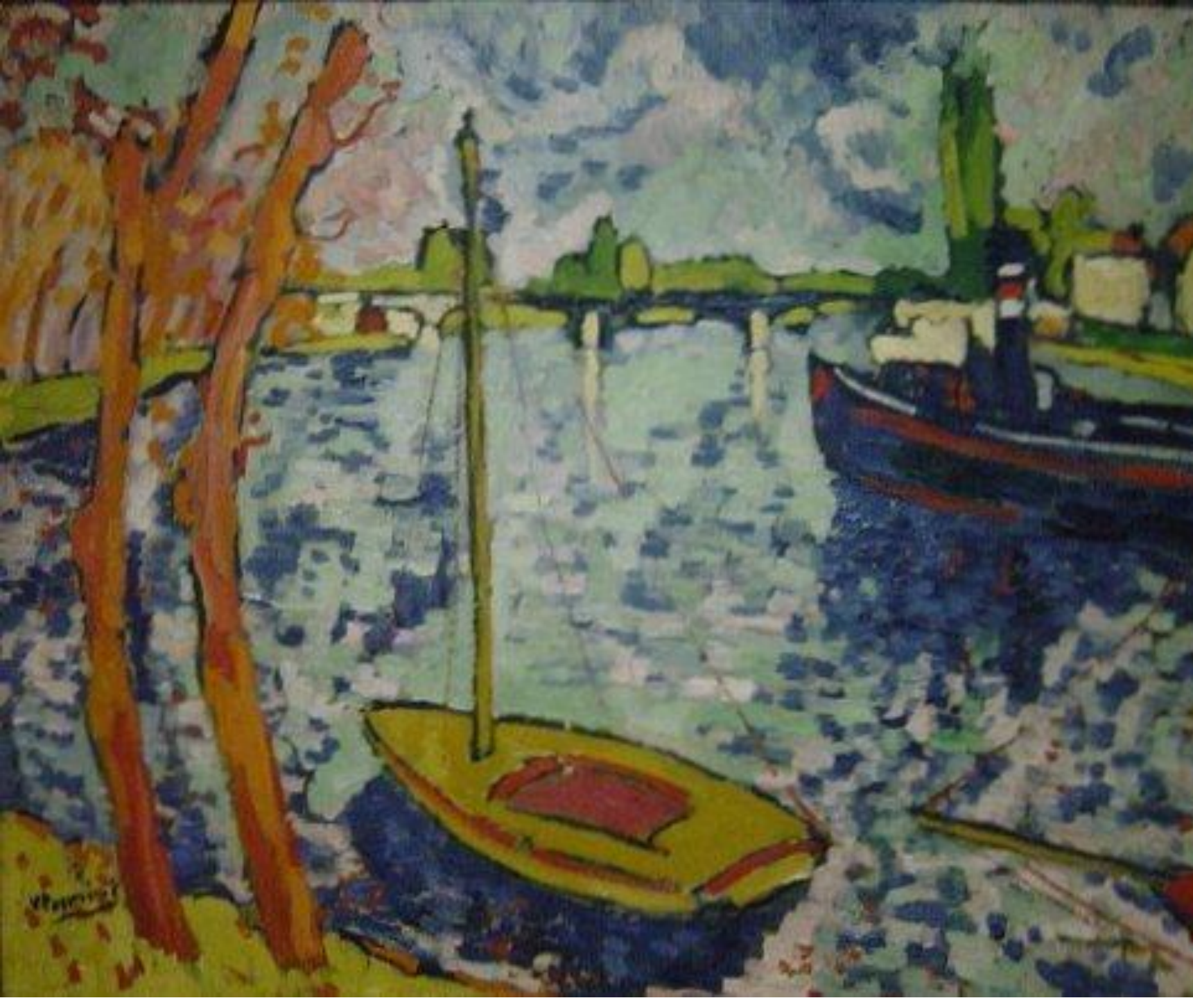
The River Seine at Chatou