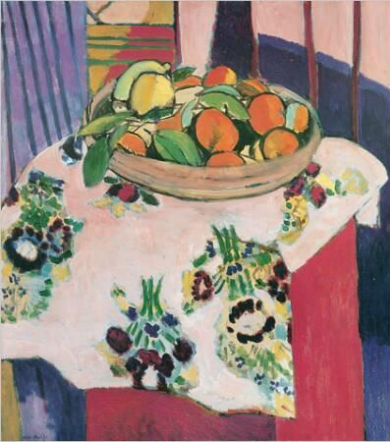
Bowl with oranges Matisse