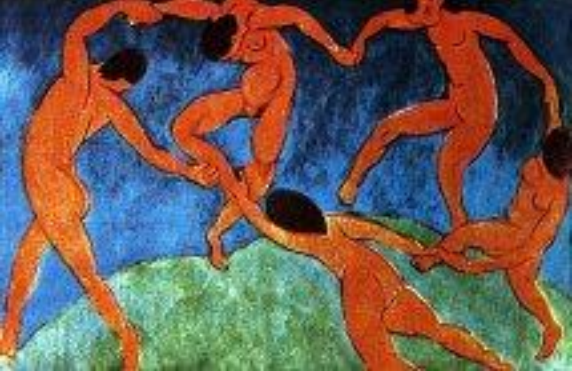
The dance Matisse