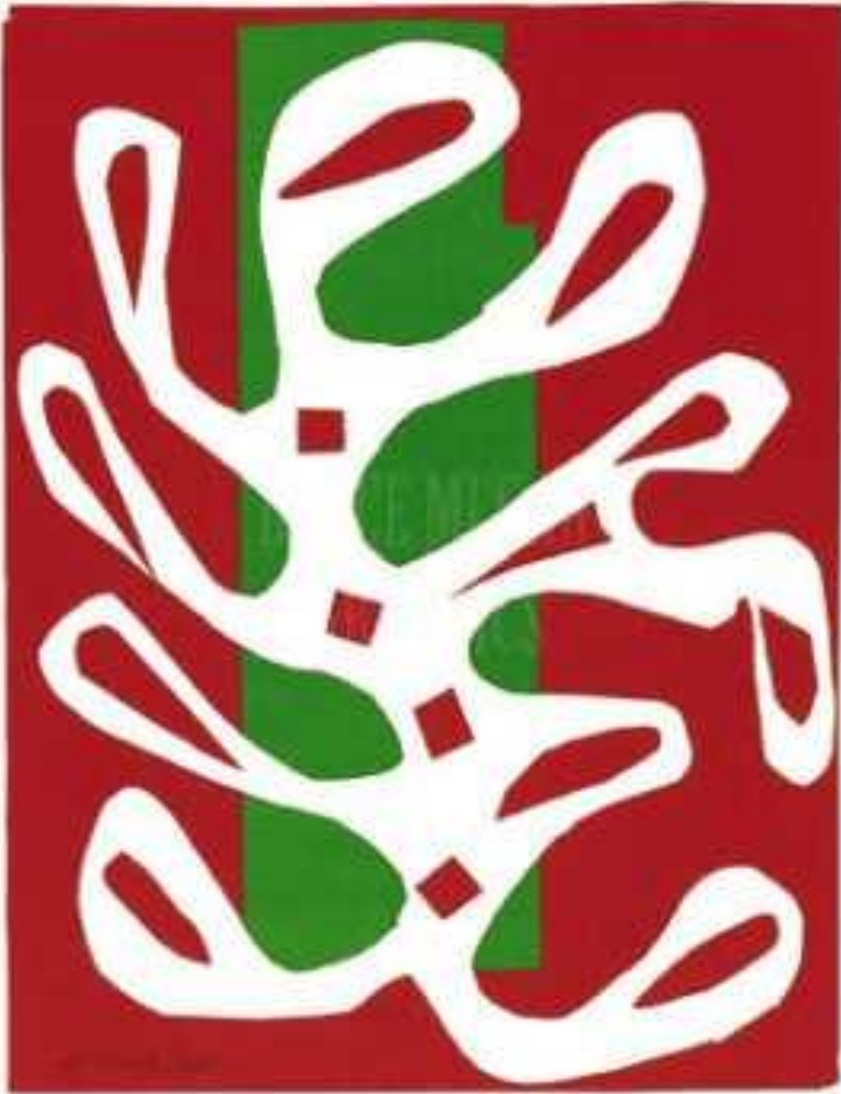
White Algae Matisse