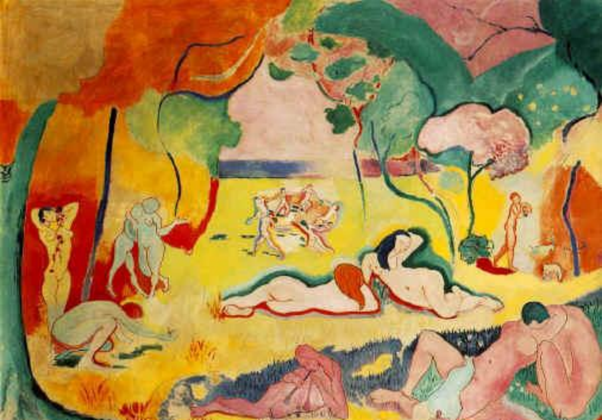
The joy of live – Henri Matisse