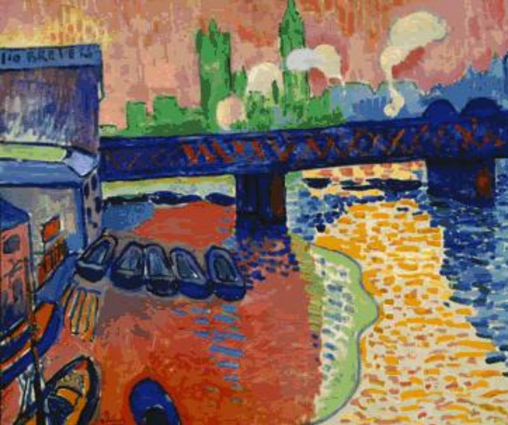
Charing Cross bridge