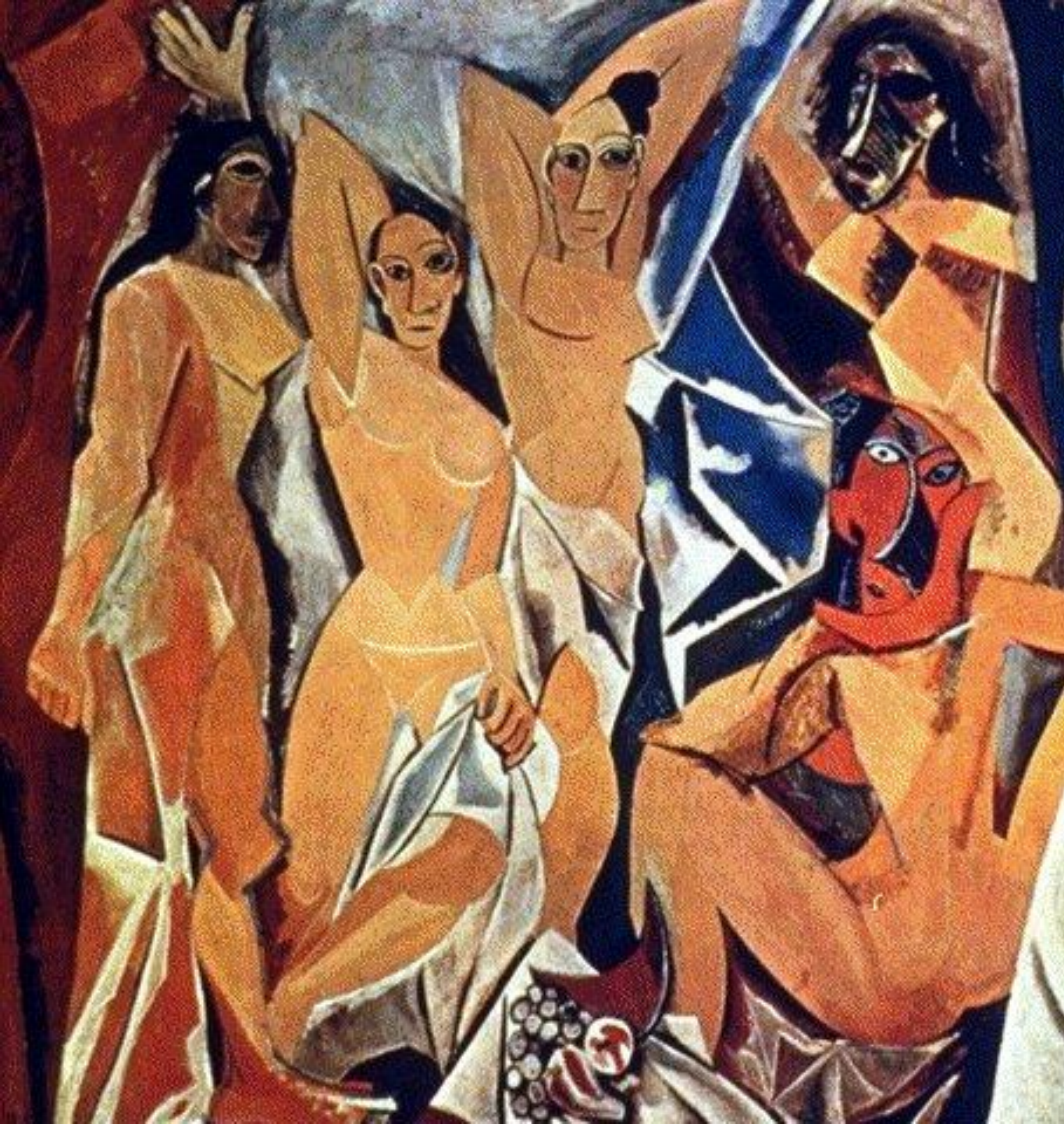
Les Demoiselles d'Avignon Pablo Picasso 1907