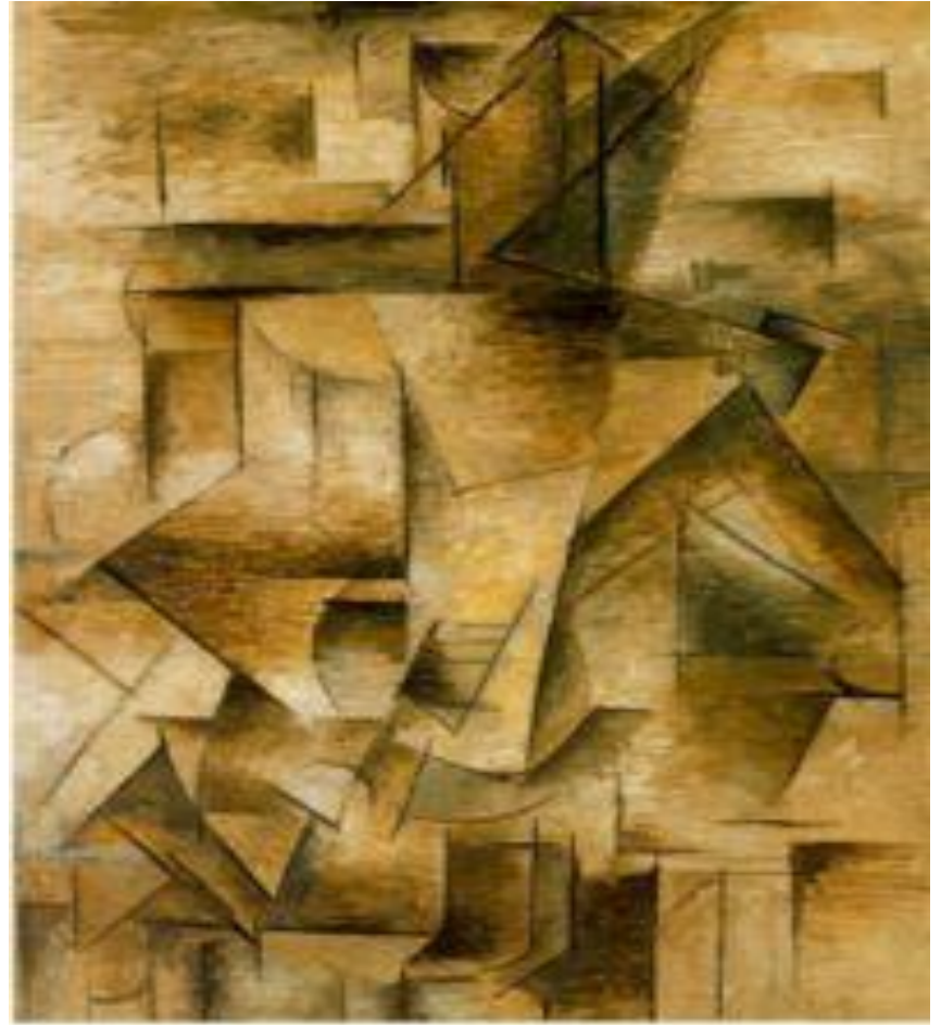
The guitar player Picasso