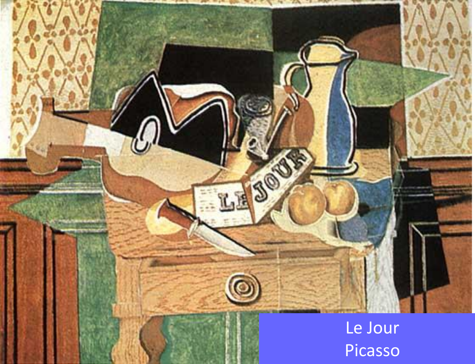
Le Jour Picasso