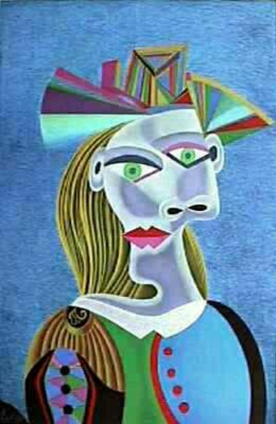
Portrait of a Woman Picasso