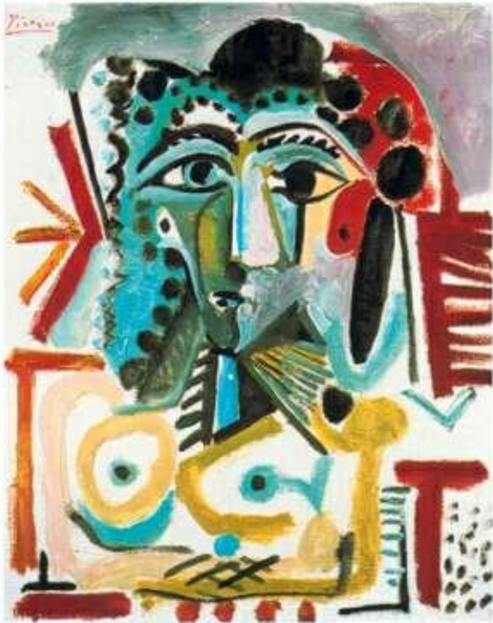
Bust of a Woman Picasso