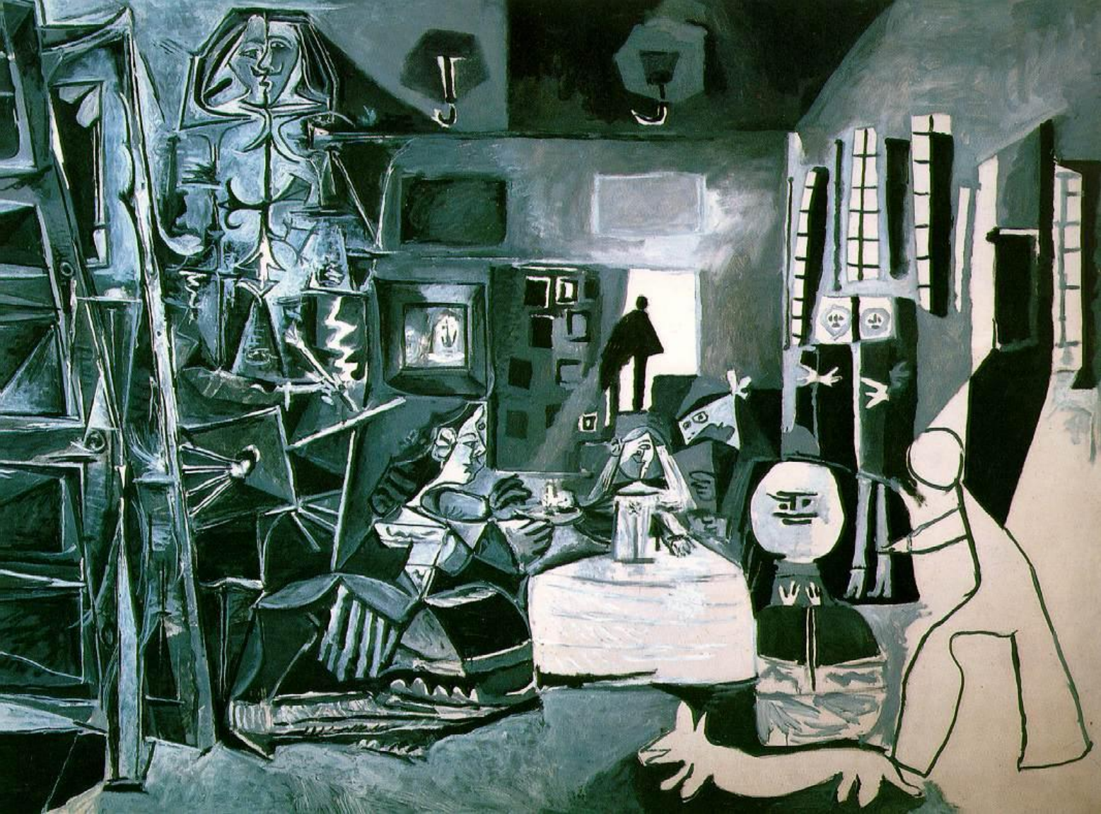
Meninas of Velasquez