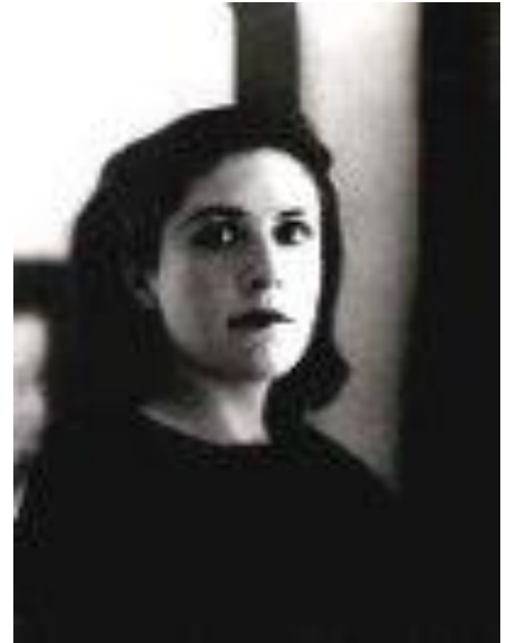
Dora Maar Picasso