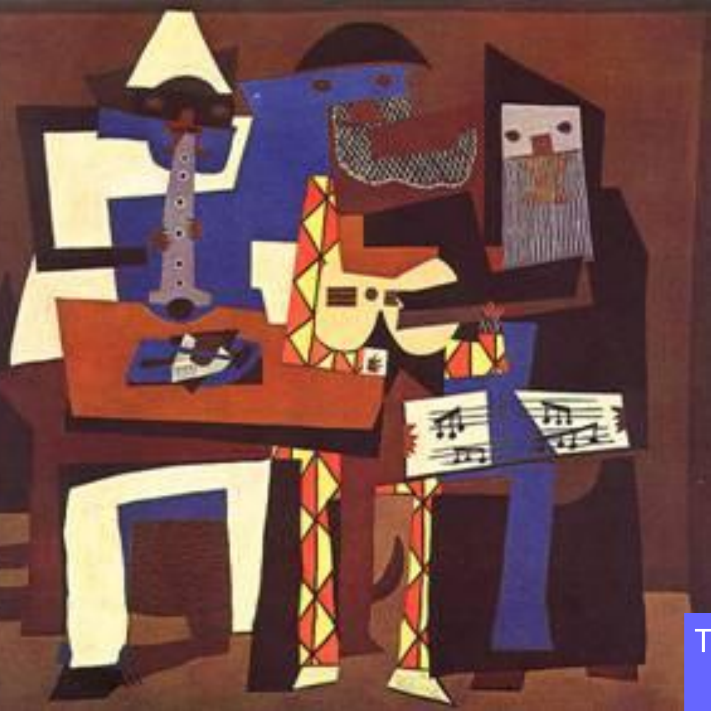
Three Musicians Picasso