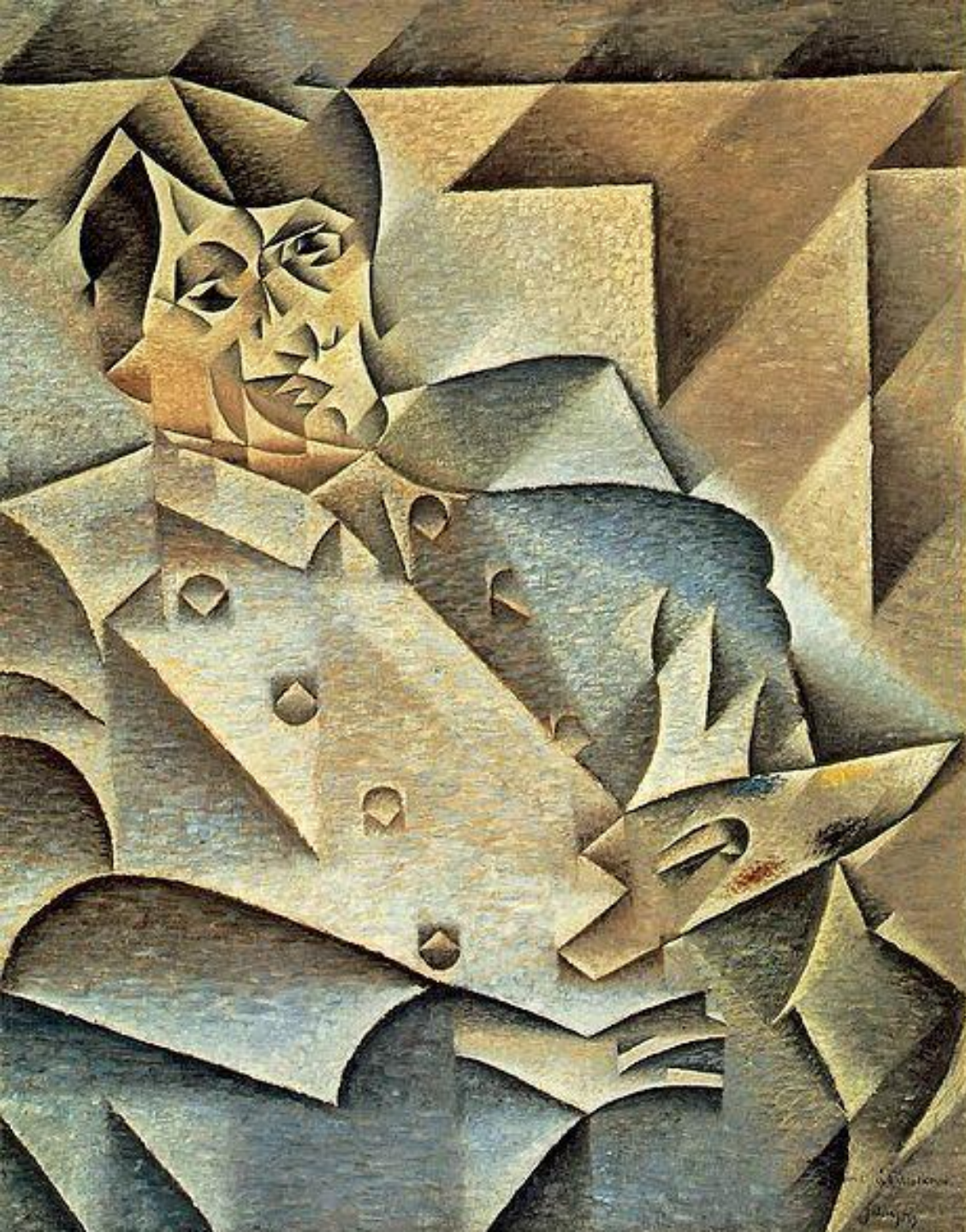
Portrait of Picasso Juan Gris