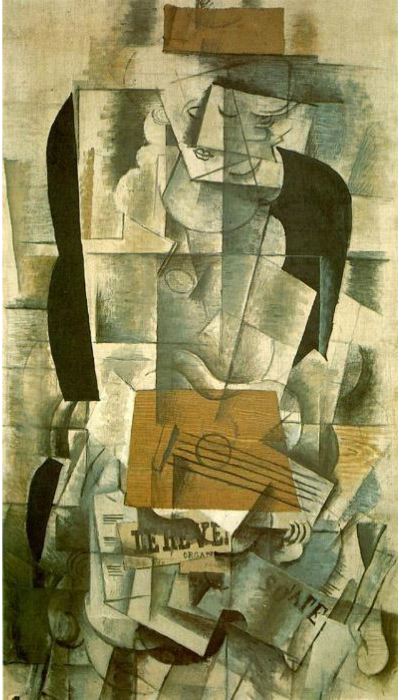
Woman with a guitar George Braque