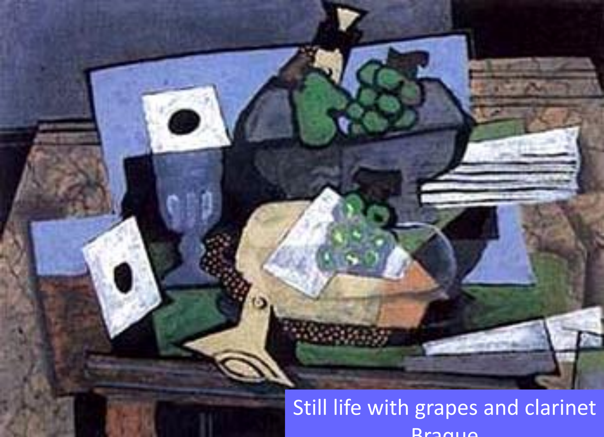
Still life with grapes and clarinet Braque