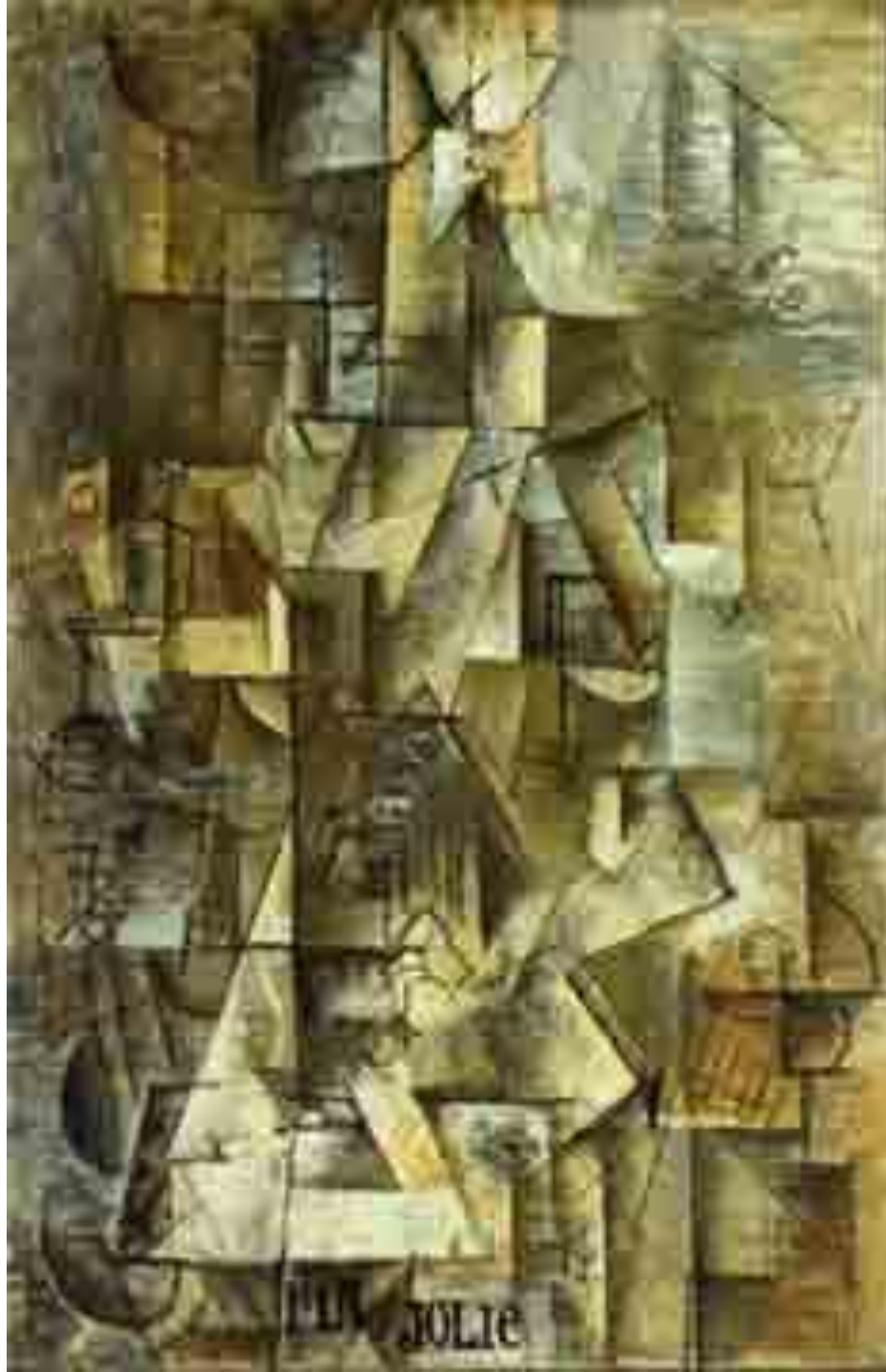
Ma Jolie Picasso