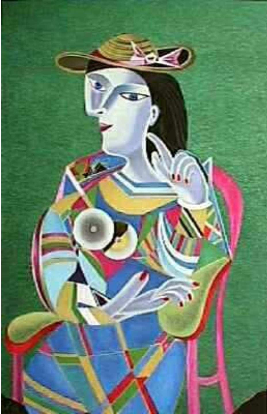
Portrait of a Woman Picasso